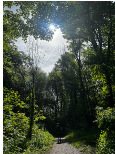
A beautiful day for our Pentecost Walk!