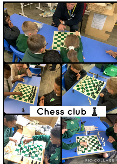
Our Chess Club taster session was a great success this week