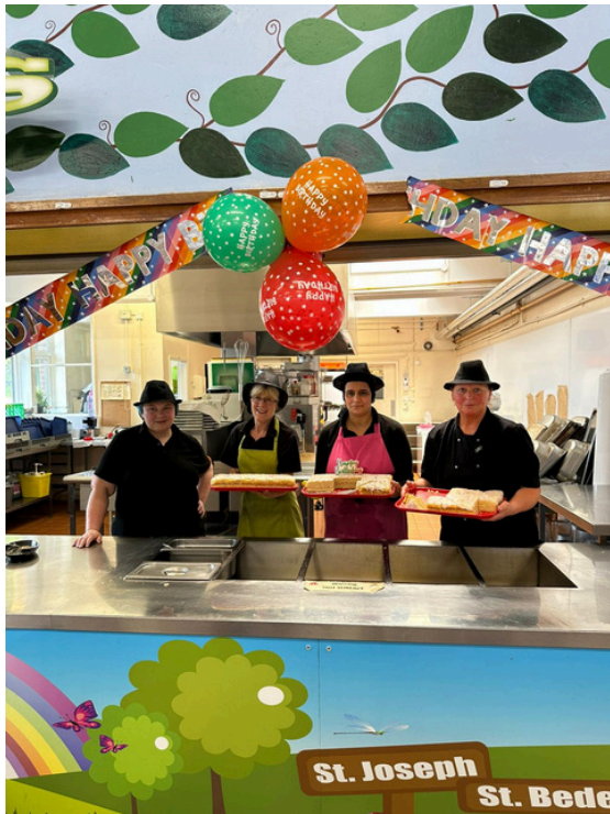
Thank you to our amazing kitchen staff for baking enough cake for the whole school for the Church's Birthday!