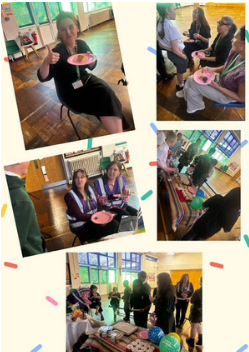
Our Caritas Ambassadors invited all the staff to share some cake and a conversation to say thank you for their hard work this term..